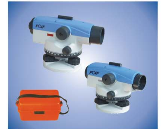
Carrying case and different color level

*Depending on staff and levelling technique